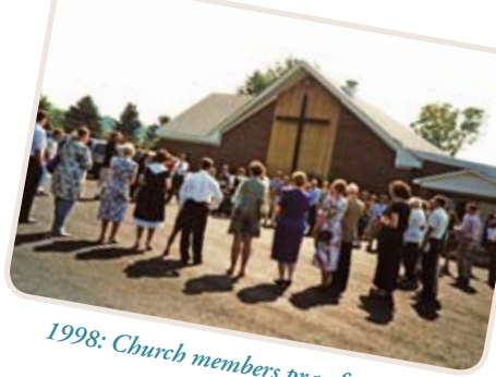
1998: Church members pray for MCC

Over the past three years, the membership and attendance of MCC has grown from a church averaging about 140 people on a Sunday, we now average 250 people or more. Our highest attendance level this past year was 367; it was also the highest attendance in our nearly thirty-five year history. Continuing to move forward toward achieving our church vision requires additional space.